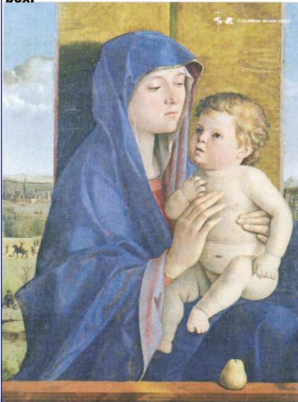
2019 Columban Art Calendar

Please put money in the St Vincent de Paul box.